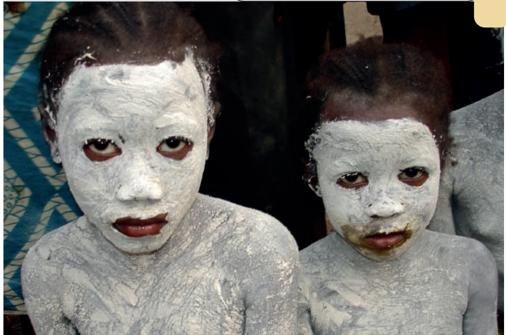
Photograph 5. Bondo initiation in Kassasie.

Sacred forests tend to be situated within the surroundings of the villages to which they belong (photo 6). Of the 4 forests visited and all of these which are realised as