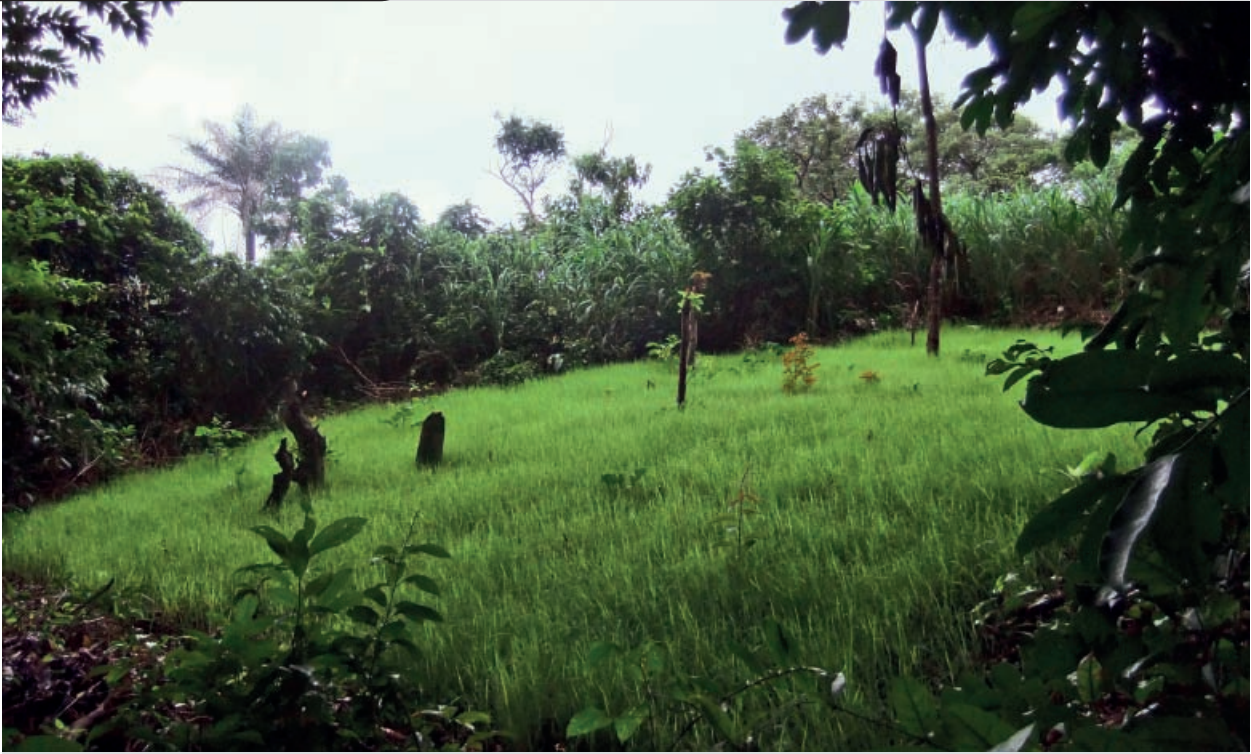
Photograph 7. Rice crop adjoint to Kamabai's sacred forest.