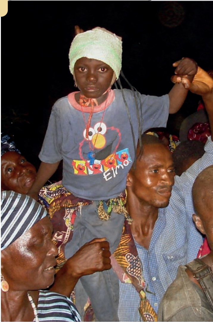
Photograph 4. Gbangbani initiation in Kabakeh.

Locals initiated into a different secret society, non-initiated or of a different sex are not allowed in the sacred forest.