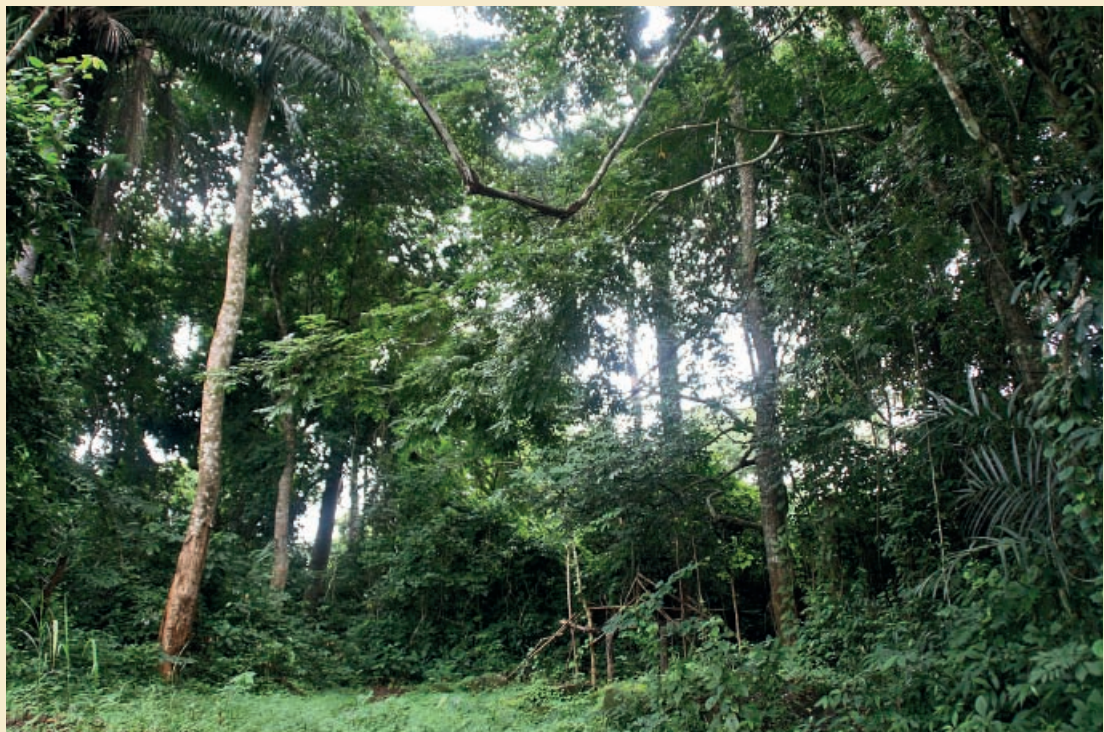
Photograph 1. The entrance of a sacred forest in Makeni.

3 University of Makeni Makeni Sierra Leone