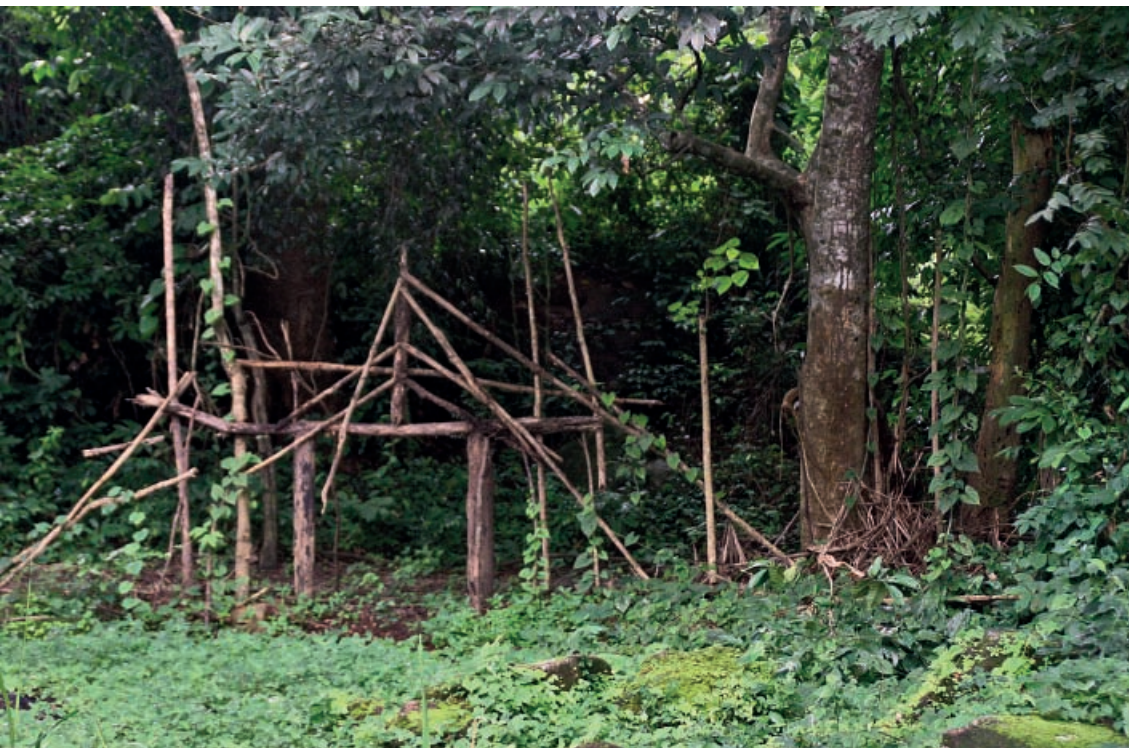
Photograph 3. Gate situated at the entrance of a poro sacred forest.