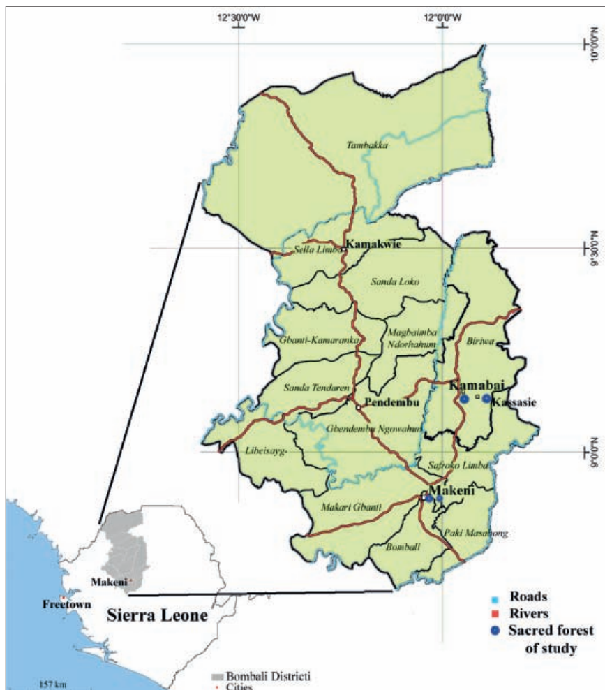
Figure 1. Localization of the sacred forests explored in Sierra Leone.

Sacred groves may also have economic value. In some cases people are allowed to pick up medicinal plants or dead wood which can be sold in local markets, bringing benefits to the families which are looking after these sacred sites (KOKOU, KOKUTSE, 2007). On a global scale, sacred forests, like all conserved forests, sequester carbon dioxide (CO 2 ), preventing it from being emitted into the atmosphere and contribute to global warming (AKACHA AKOHA, 2003).