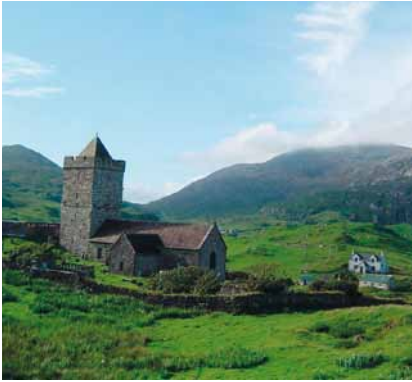
St Clement's Church and Mt Roineabhal, Isle of Harris.