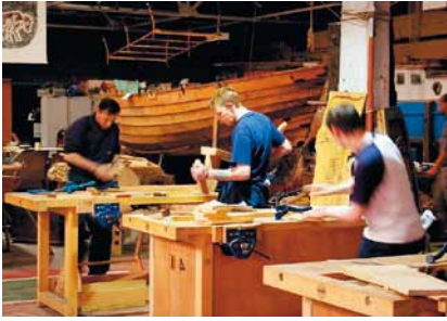
GalGael Trust Workshop – Participants on 'Navigate Life'.

ing disaffected urban youth with their natural environment. In a programme called Navigate Life , young people work with retired shipyard workers. Activities include building traditional boats that are sailed down the river, both actually and symbolically reconnecting coastal communities while mending lives traumatised by violence, addictions and poverty.