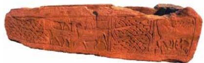
Deer hunting scenes and Celtic eternity knotwork on St Constantine's Sarcophagus, Govan Old Parish Church.

An example is the GalGael Trust. It draws inspiration from the Christian symbolic and nature imagery on the church's carved stones in reconnect-