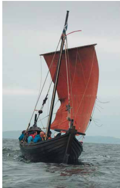
The GalGael Trust on the Firth of Clyde.

Based on the above examples the Cycle of Belonging (McIntosh 2008) posits community of place as the starting