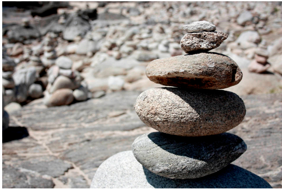
Figure 7. Stone heaps along the Camino de Santiago.