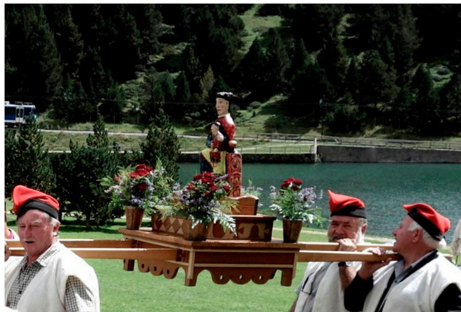
Figure 4. The patroness of the Pyrenees, la Mare de Déu de Núria, is carried to her sanctuary on 1 September 2016, the feast of St. Giles, patron saint of shepherds.

In Christian theology, Mary is not a person of the Holy Trinity, yet intense popular devotion and veneration gave rise to her cult and fostered an impressive iconographic development of her image. In most processions, her images are surrounded by flowers and often the final stretch of the route is carpeted with branches, leaves, and petals (Figure 4).