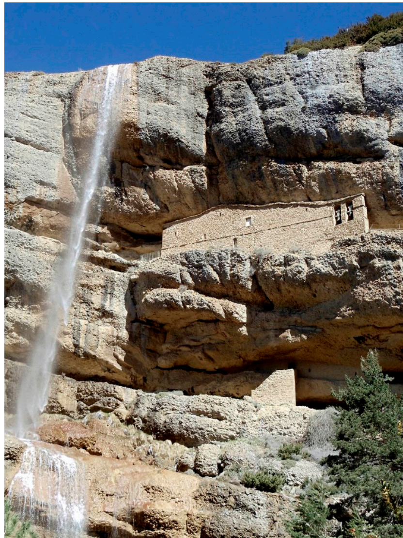
Figure 2. The Yebra de Basa Hermitic complex near Santa Orosia , Aragón. (Photo: Jaime Tatay).

In sum, just as the tree (thorny bush)— rock (cave)— water (fountain) are some of the key natural elements that articulate the sacredness of a SNS (Figure 2), the sanctuary—image—miracle also configure a complex unity mediated by distinctive, local narratives, devotions, and rituals. According to José María Fuiench, “Water, tree, and rock are elements that have always formed a universal cosmos, wherever a hermit dwells. A trilogy of life where the water symbolized purification; the tree, regeneration; and the rock, immortality” (2007, p. 17).