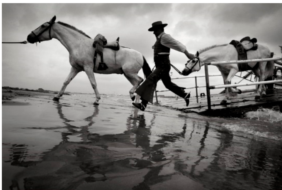
Figure 10. Pilgrims on their way to El Rocío.

In the baroque mentality, holy water from heaven was a divine remedy for drought. This is the reason why, in a plenary agreement of the town of Almonte held in 1726, the city hall decided to ask its Patroness to bring the “ Santo Rocío de sus aguas ” ( The Holy Dew of its waters ). Nowadays, even though modern irrigation systems pump underground water during dry years, devotion to the Madre de las Marismas has not declined. On the contrary, it has increased substantially over the last decades, attracting ever larger numbers of pilgrims, since, as Antonio Ariño wrote three decades ago, “old rituals with a clear agrarian functionality (a plea for rain) are taken up again in a different socioeconomic context and are transformed into symbols of a real or longed-for identity” (Ariño 1989, p. 483).