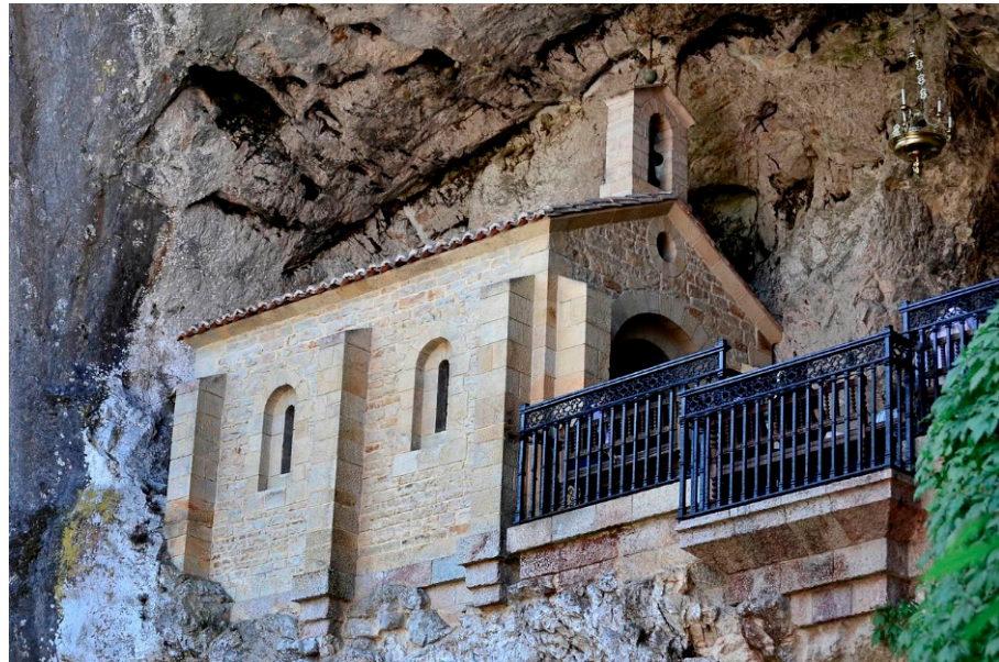
Figure 6. The chapel of Covadonga.

the custodians at the Santuario de Covadonga affirmed, “the hierophanic elements of the mountain, the cave, and the water play an important role in the (local) religiosity. The image of the Virgin of Covadonga is venerated inside the cave”. Likewise, at the Virgen de la Cueva Santa (Virgin of the Holy Cave) sanctuary in Altura (Castellón), the local priest underlined the importance of Cueva (cave) as an advocacy or Marian title and brought to the fore the fact that she was the Patroness of Speleologists.