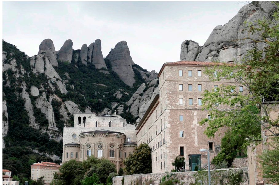
Figure 5. The impressive monastic complex of Montserrat is surrounded by mountains and forests (Photo: Pixabay).

the procession that leads the devotees to the sanctuary (Figure 5). Additionally, of course, bouquets of flowers are usually offered as a sign of gratitude and left at the altar or around the image presiding the sacred site.