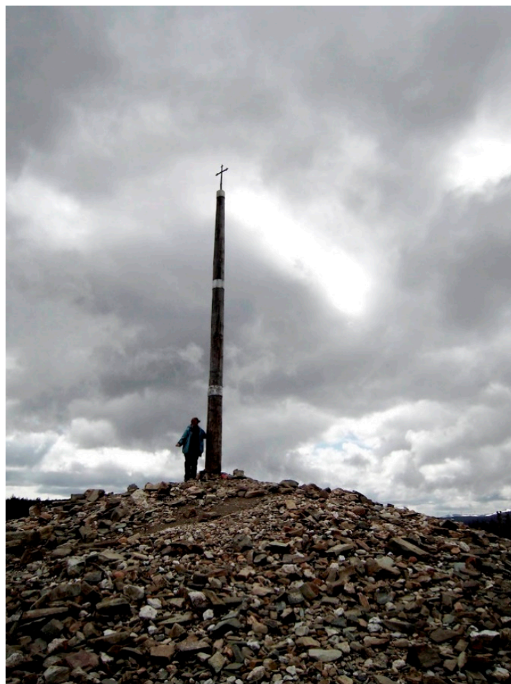
Figure 8. Over the years, pilgrims along the Camino de Santiago have left thousands of stones and pebbles forming large humilladeros , like the one sitting under La Cruz de Ferro.