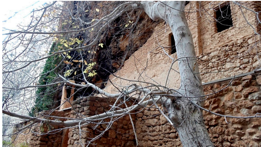
Figure 3. San Martín de la Val de Onsera (Saint Martin of the Bear Valley) is the only SNS named after an animal in the Aragonese Pre-Pyrenees.